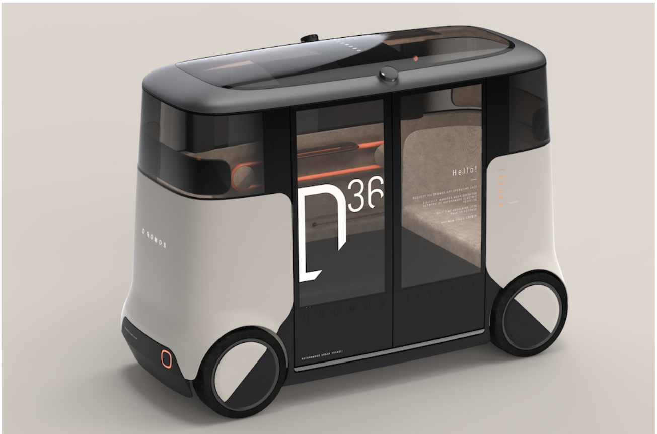
Dromos self-driving vehicle